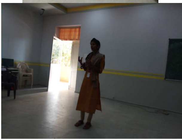
Theme based concept presentation Competition for College Students