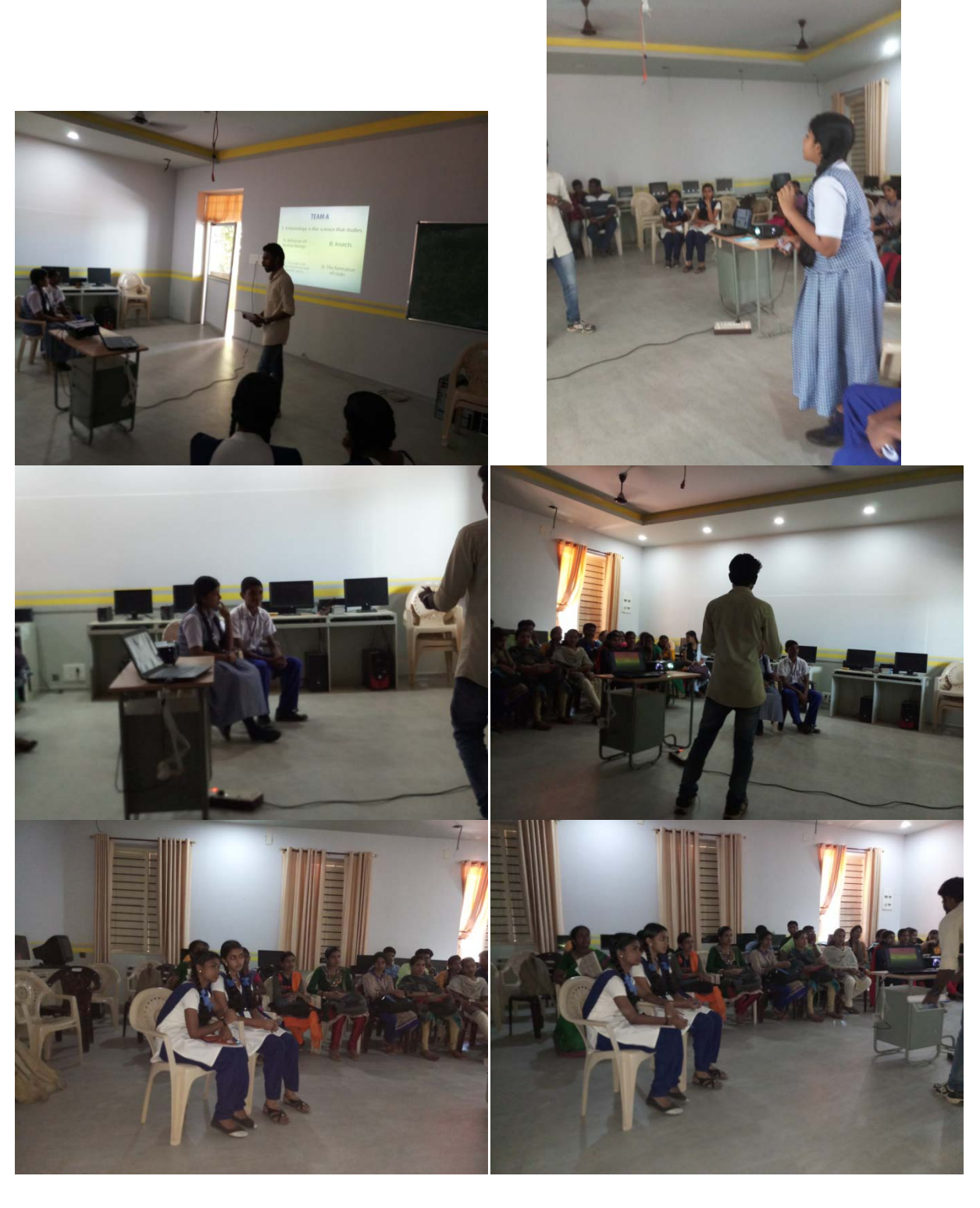
Quiz and Debate Competition for School students