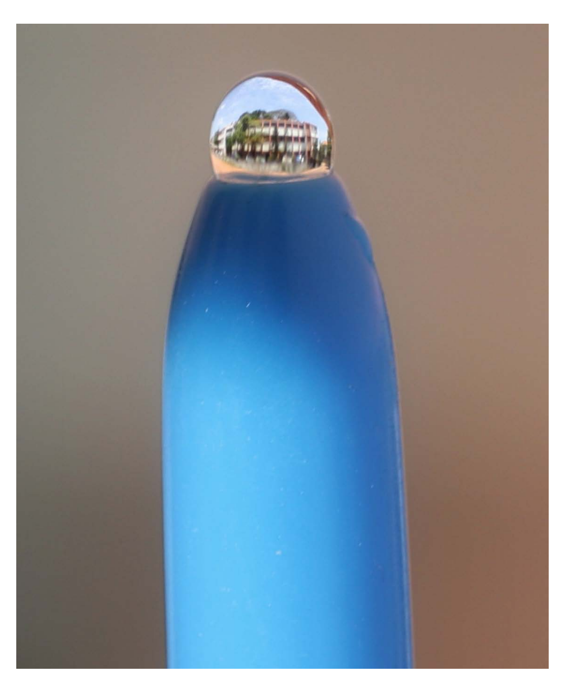
Photo that got Ist Prize for spot photography on the theme Beauty of the campus